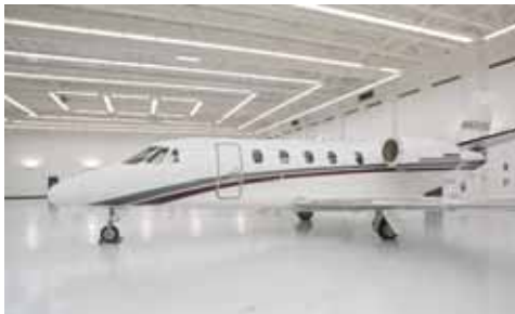
Cessna Citation XLS

You can count on Delta AirElite to give you the best possible options for your travel needs. For more information on Fleet Charter, please call 800-927-0927 option 1.